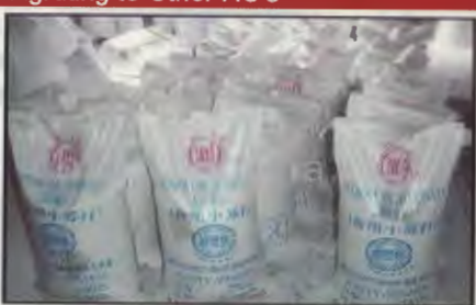
Potassium Chlorate 50Kg Bag