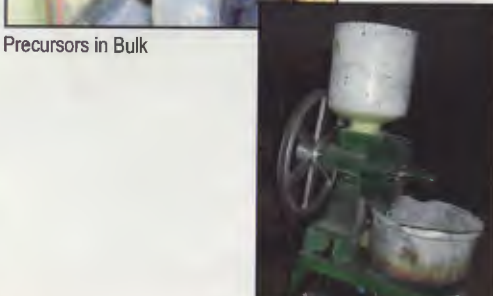
Grinder - Used to Crush AN and CAN