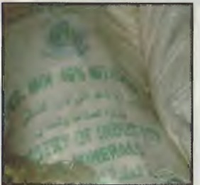
Urea Fertilizer - 50Kg Bag