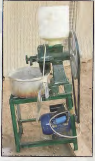
Grinder - used to crush AN and CAN

There is NO Reason to Grind or Cook Any Fertilizers, Discovery of These Processes Indicates HME Production.