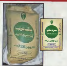
CAN Fertilizer, PAKARAB (Fatima)