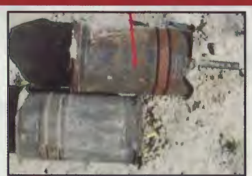
Modified Munitions (DFFC)