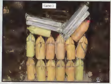
Primed AN-AL Filled YPOC, and Low Metallic Signature Pressure Plates