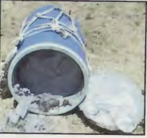
AN-AL in Igloo Type Cooler