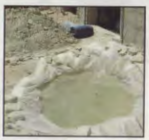
Chemical Mixing Pool