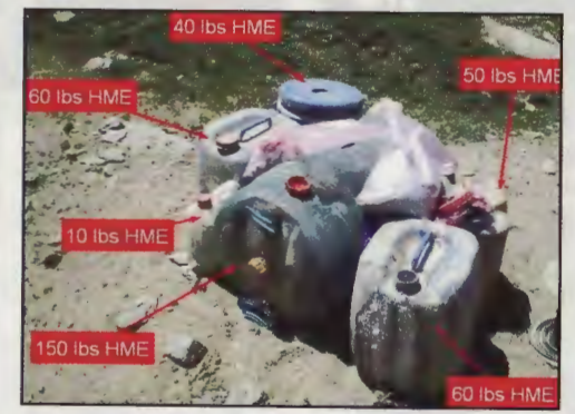
Various Plastic Containers