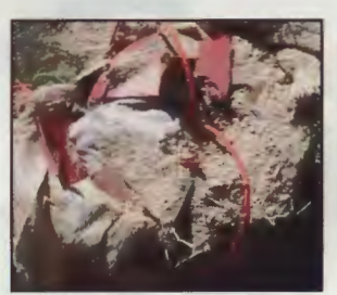
Potassium Chlorate Mixed with Saw Dust

PC Based HME is Predominately Found in RC-E, However it is Migrating to Other RC's