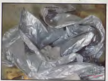
Unidentified HME (Possible AN-AL)