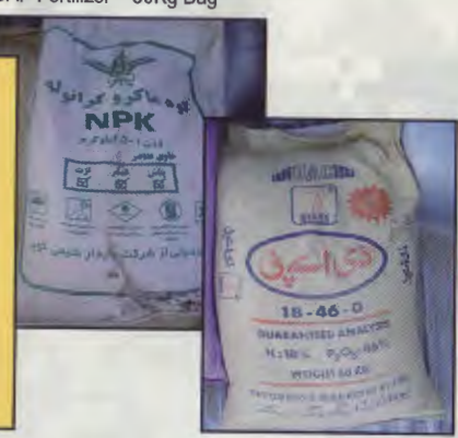
DAP Fertilizer - 50Kg Bag (Nitrogen content 18%. Phosphate content 46% this is NOT Urea)