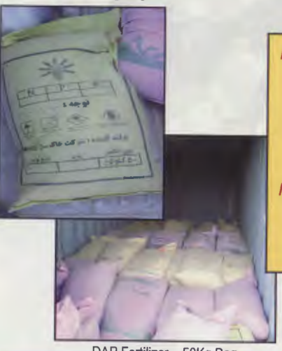
DAP Fertilizer - 50Kg Bag