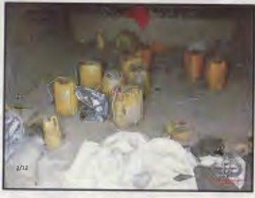
Primed AN-AL Filled YPOC, Aluminum Powder, Fertilizer Bags