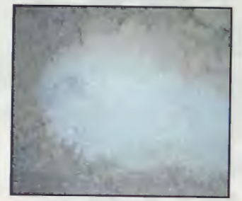
AN-AL Spill on Ground