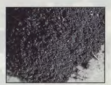
Potassium Chlorate & Aluminum Aluminum not typically found with PC.

PC Based HME is Predominately Found in RC-E, However it is Migrating to Other RC's