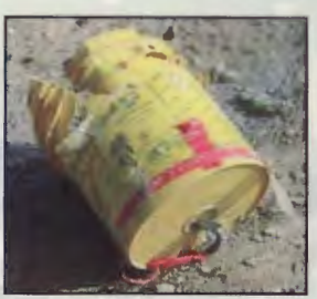
Plastic 5 Gal. Bucket