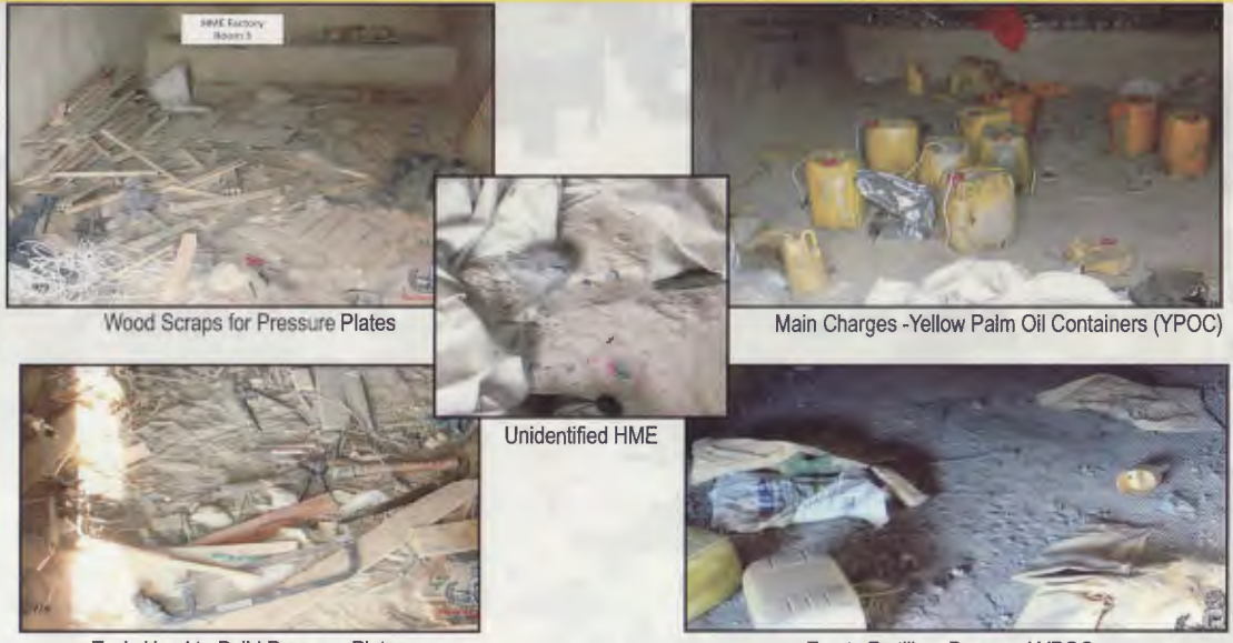
Tools Used to Build Pressure Plates

IED Factories are Typically Found to be Disorganized and Sloppy