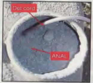
AN-AL in Yellow Palm Oil Container