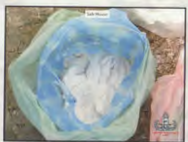
Unidentified HME (Possible AN+Sugar or Potassium Chlorate)